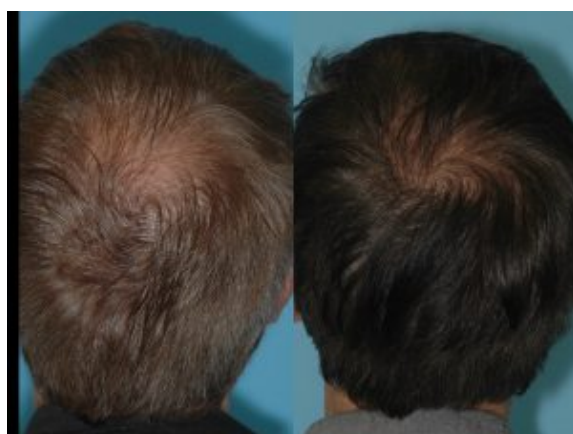
One year after SmartGraft hair transplantation.