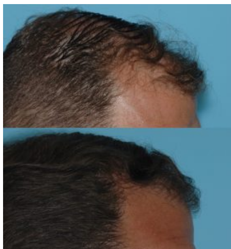
One year after SmartGraft hair transplantation.